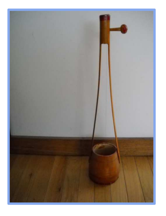
"The Diversity of Harmony"